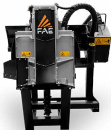
Hydraulic side shifting for accurate positioning over the work area