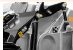
Self-leveling skids with hydraulic depth control