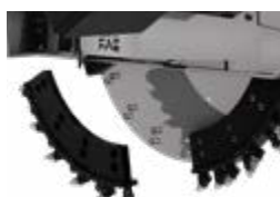
Modular cutting discs of 3.2, 4 or 4.7 inches