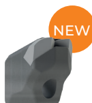
MINI C/3 (option)