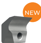
Blade MINI BL (standard)

Data refers to machine as standard set-up. Options may have reflects on weights and dimensions. The technical data in this catalogue may be altered without prior notice.